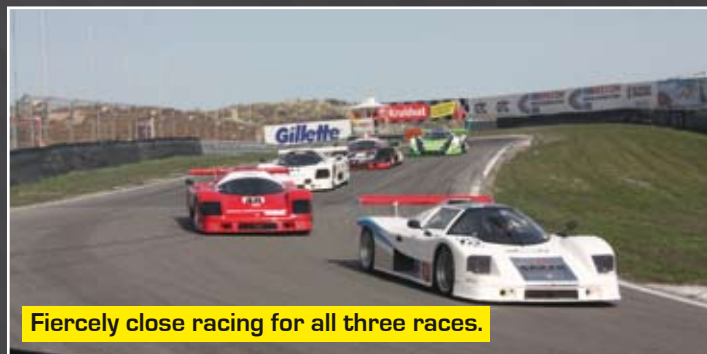
Fiercely close racing for all three races.

Following a successful season opener, Saker Challenge UK are looking forward to welcoming the Dutch teams to Snetterton for the next round on the 29th May