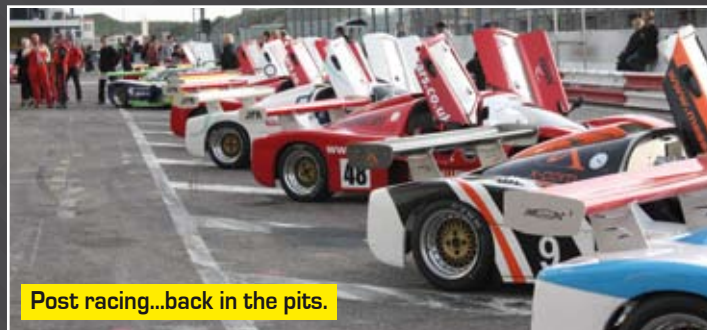
Post racing...back in the pits.