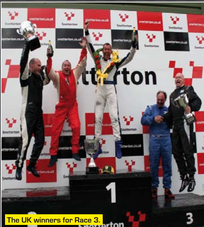
The UK winners for Race 3.

18.25hrs on Wednesday 3rd August plus repeats over the following week (full schedule TBC)